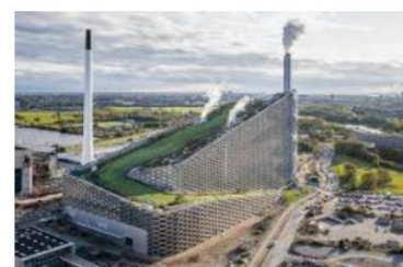
Copenhagen – has a ski slope on top