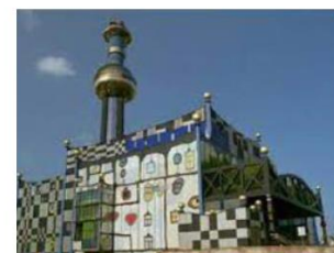
Vienna – designed by the Architect Hundertwasser is a tourist attraction