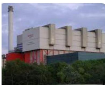
Tyseley is an older generation ERF